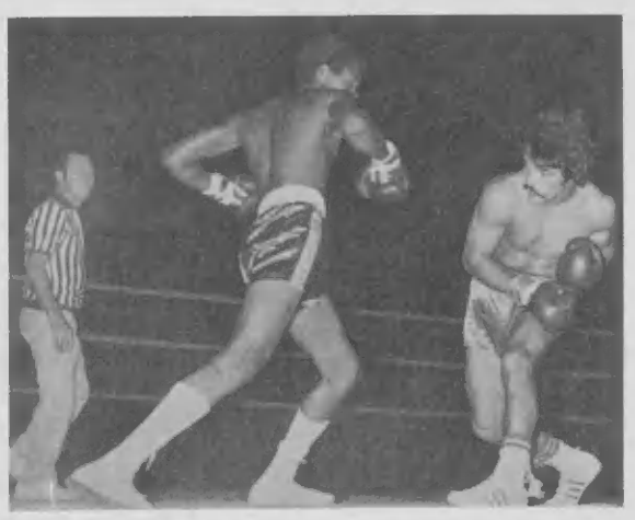
International boxing - Wilhelmina Stadium